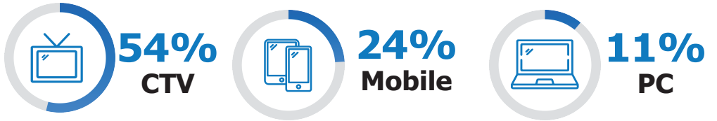
Conviva Q1 2020

Poor experiences on any platform can lead to stream abandonment, ad delivery failure, churn, and poor reviews—which combined contribute to massive loss of revenue.